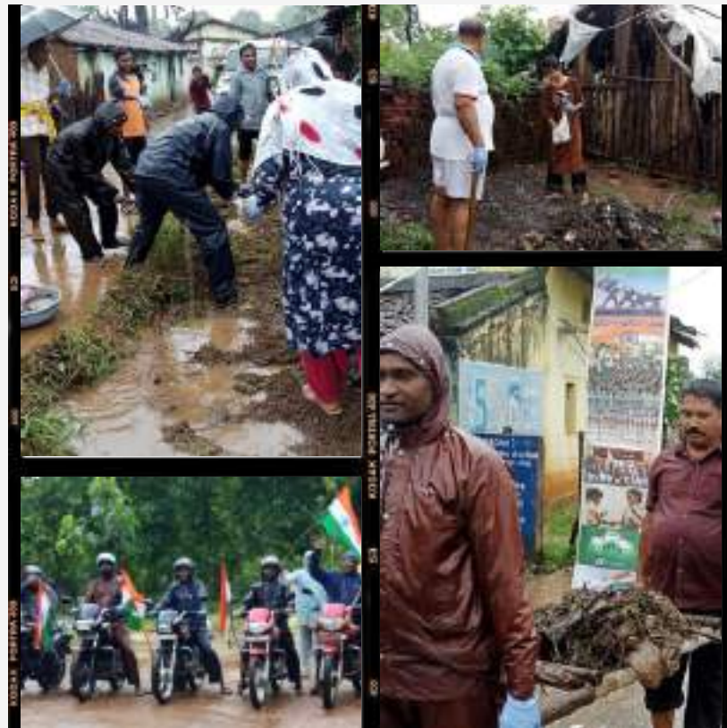
Independence day observation with Sanitation Drive