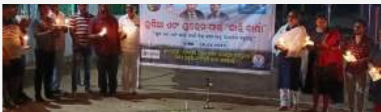
Peace Appeal and Prayer for Persons Suffering from War in Russia, Ukraine