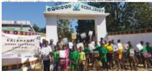
cycle rally to sensitise people about climate change effects

We are thankful to our Partners in the Journey