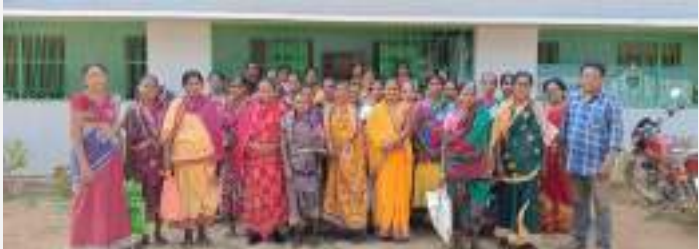
Association of single Women

Capacities of Panchayati Raj Institutions expanded, enabling effective policy and programme implementation